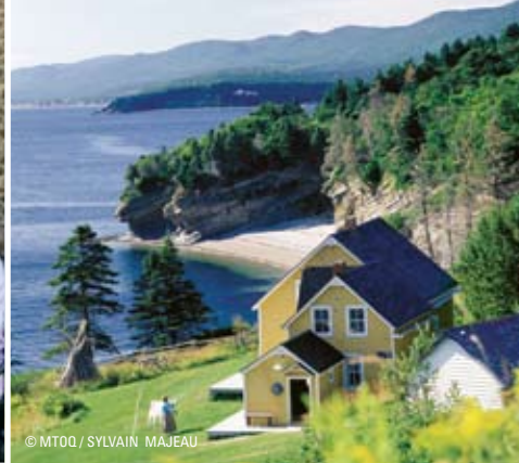
CANADIAN TOURISM COMMISSION